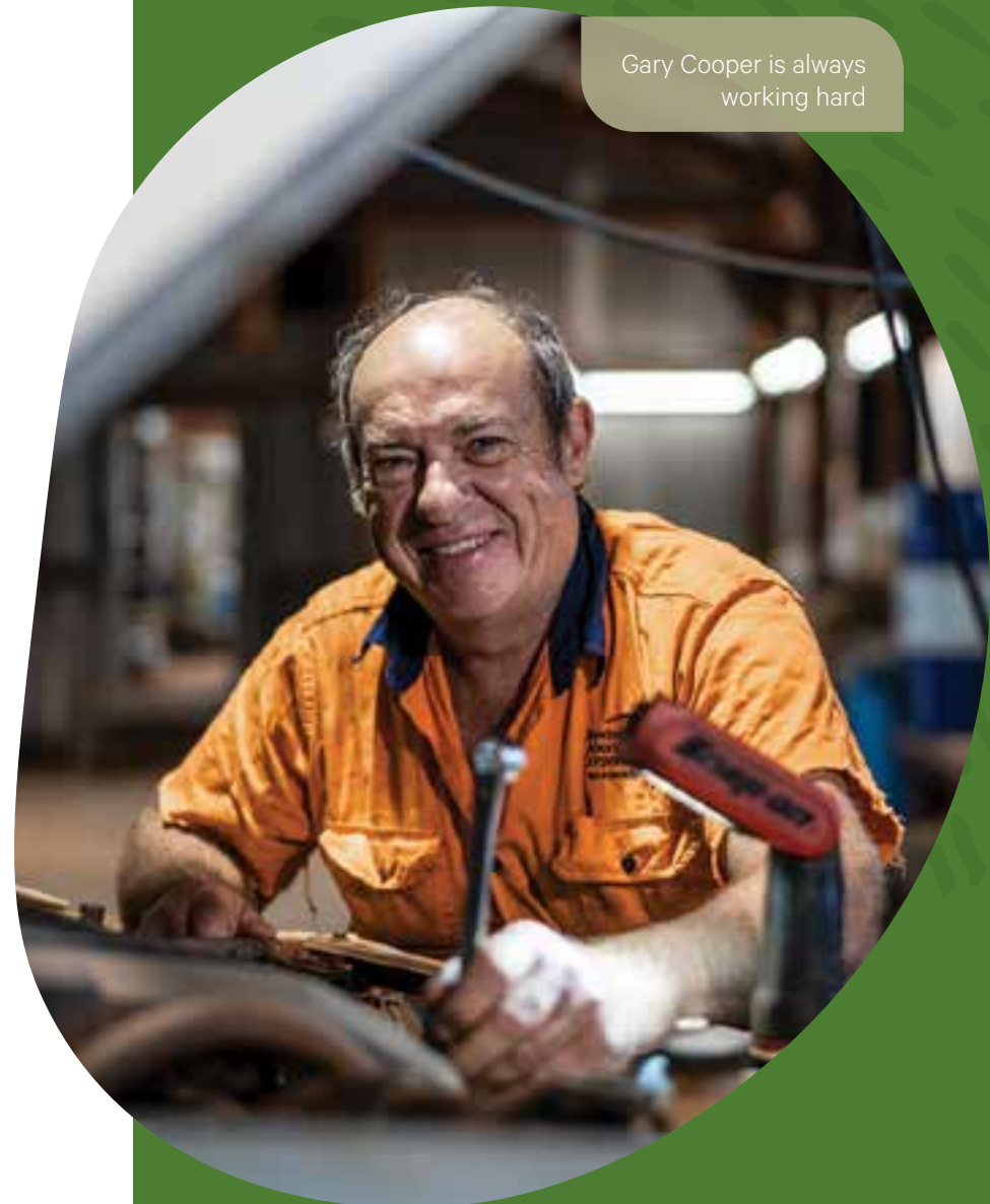
Gary Cooper is always working hard