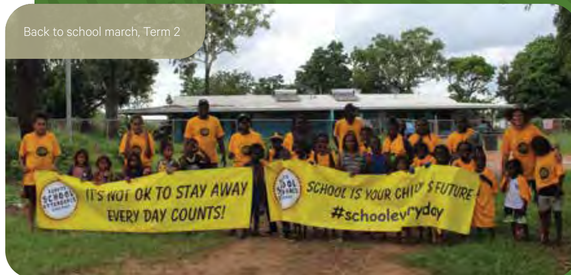
Back to school march, Term 2