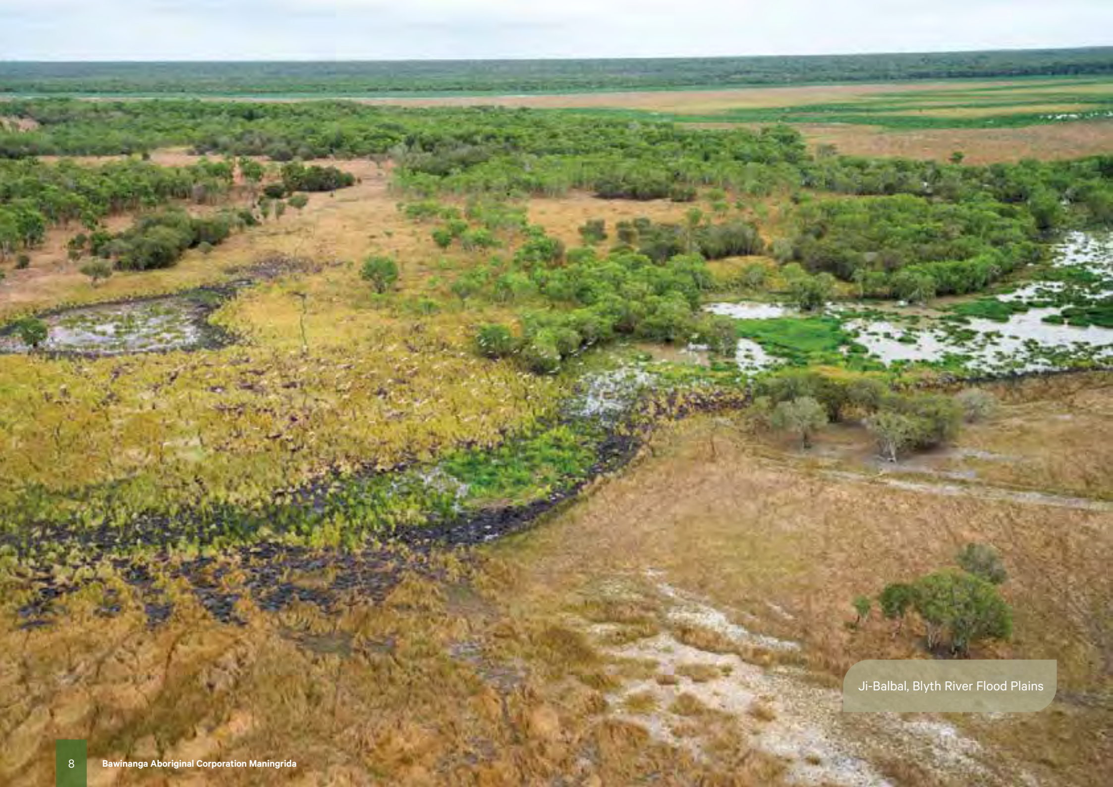
Ji-Balbal, Blyth River Flood Plains