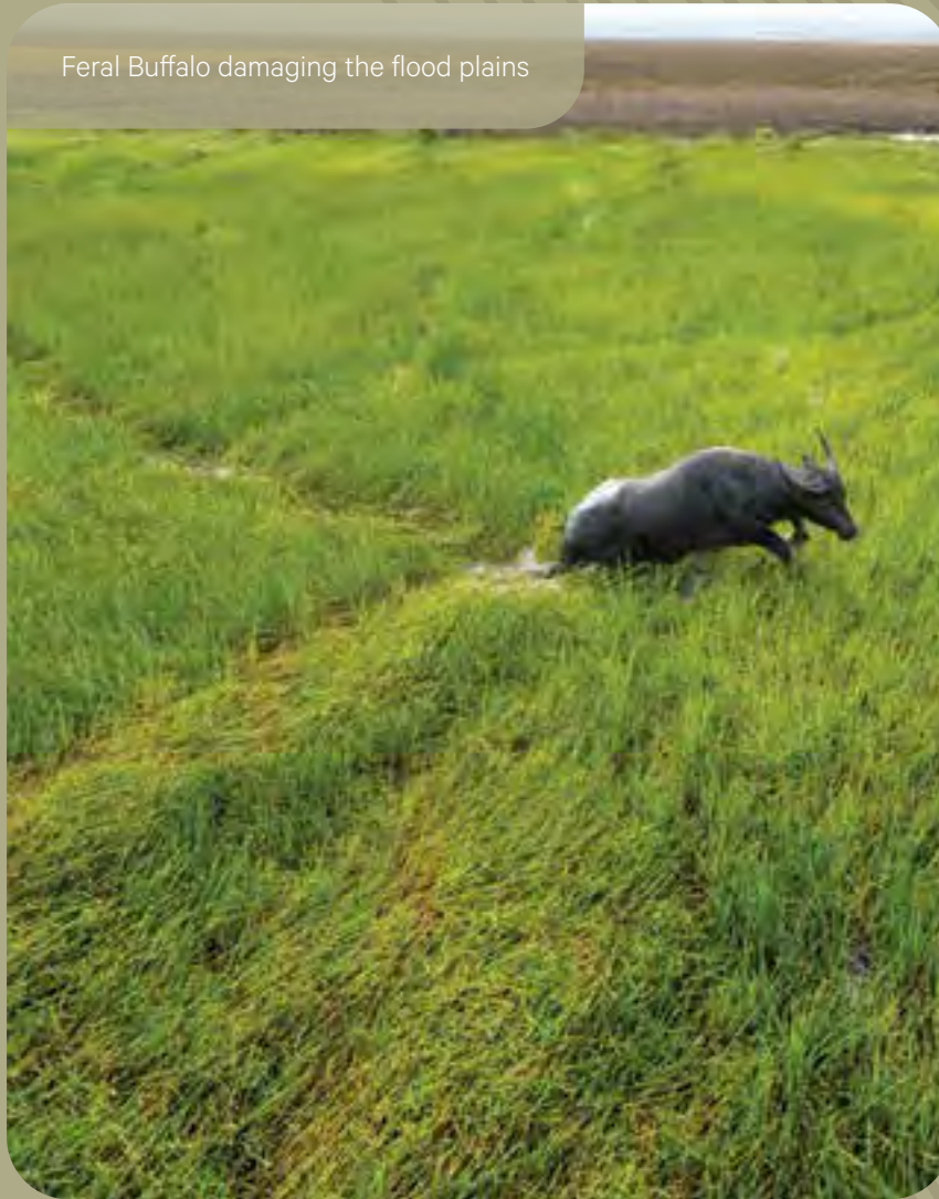
Feral Buffalo damaging the flood plains