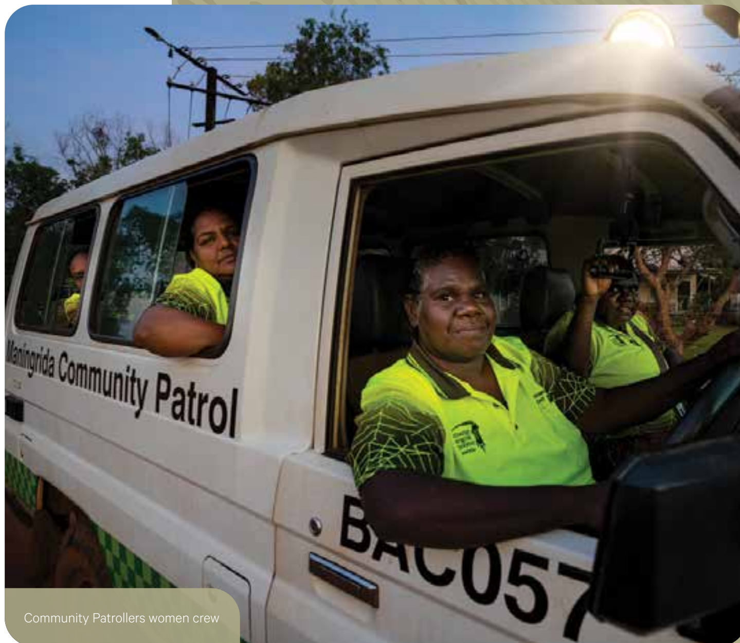
Community Patrollers women crew