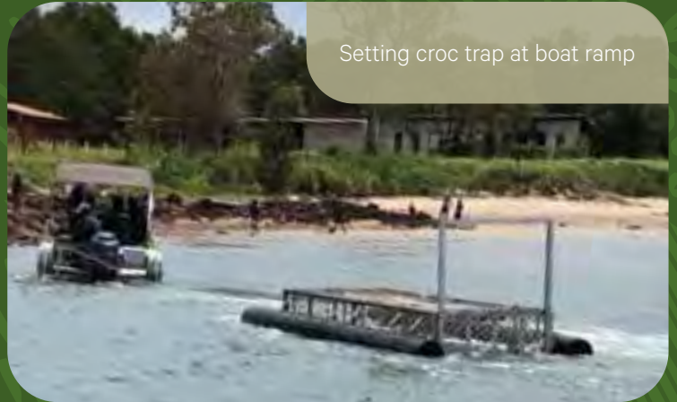
Setting croc trap at boat ramp