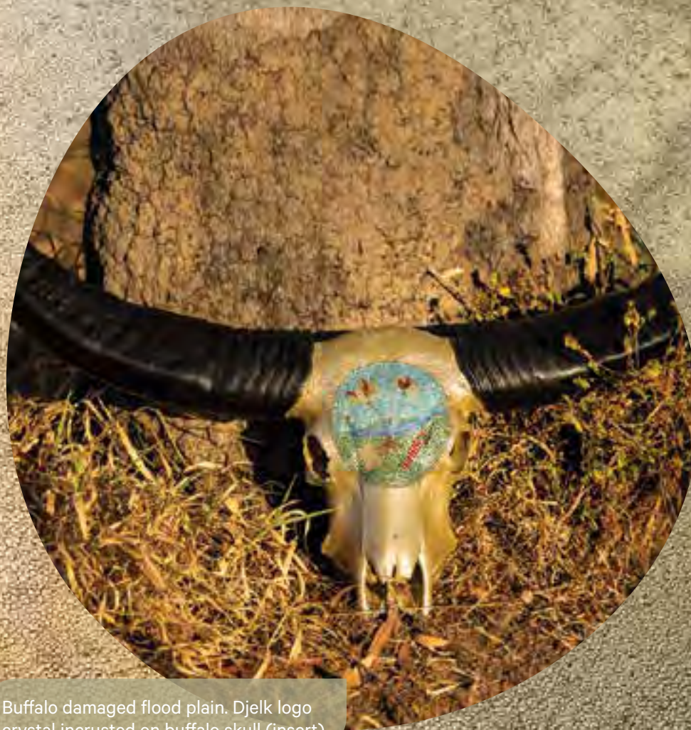
Buffalo damaged flood plain. Djelk logo crystal incrustated on buffalo skull (insert)