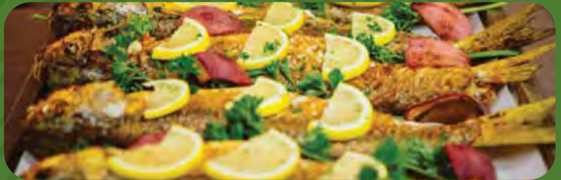
Wildfoods harvested from country