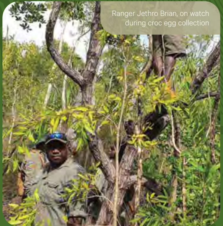
Ranger Jethro Brian, on watch during croc egg collection